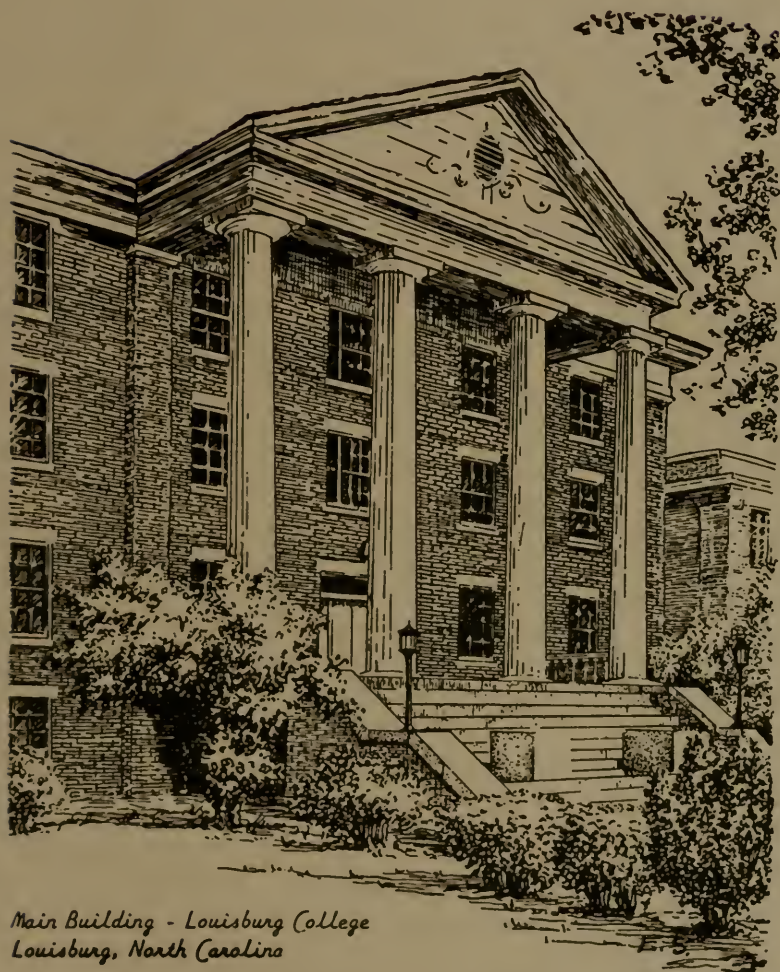
Main Building - Louisburg College Louisburg, North Carolina