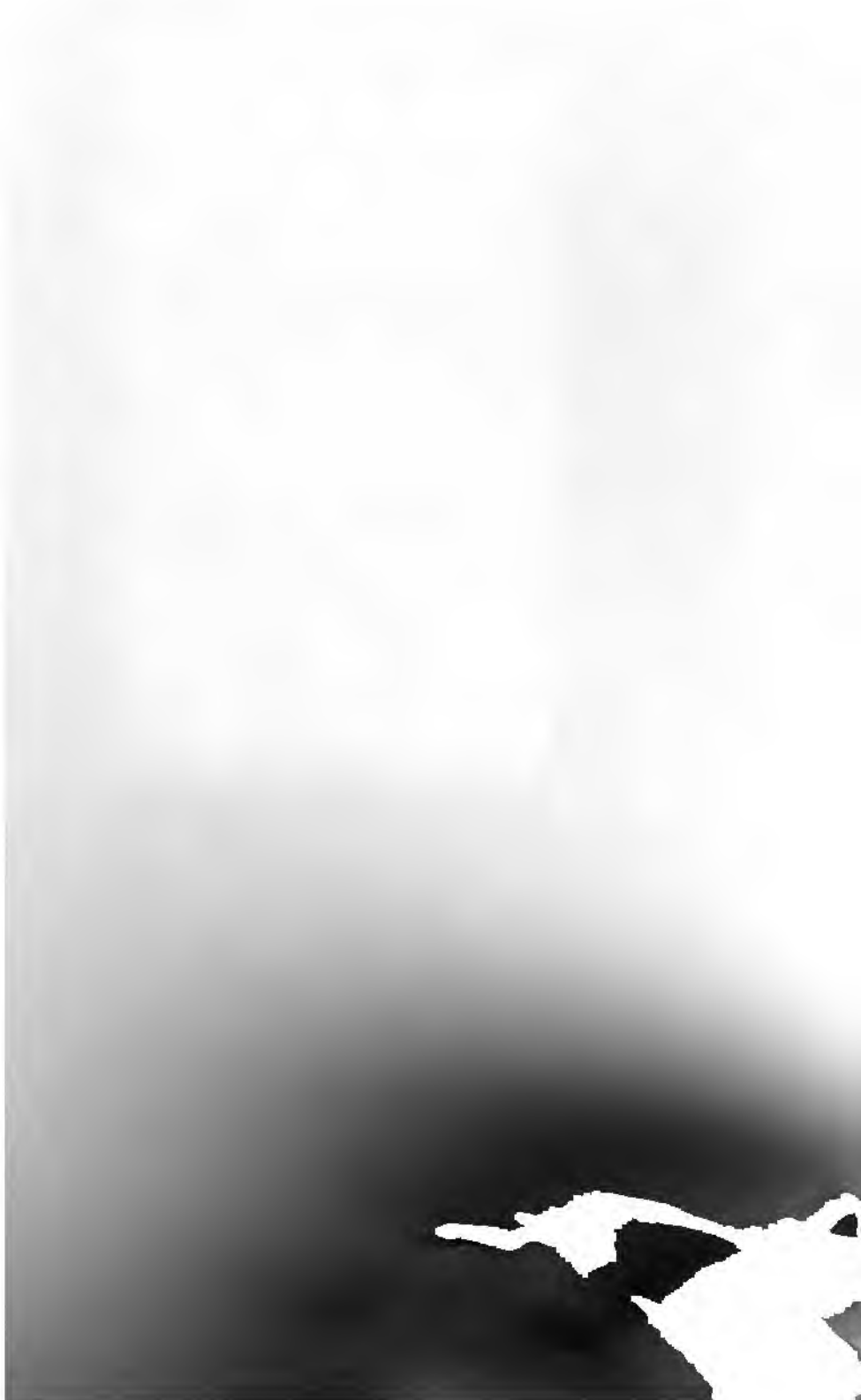
Figure 1. Aerial photograph of a coastal area showing a large, irregularly shaped, light-colored area (likely a beach or dune) in the foreground, and a dark, irregularly shaped area (likely a forest or wetland) in the background.