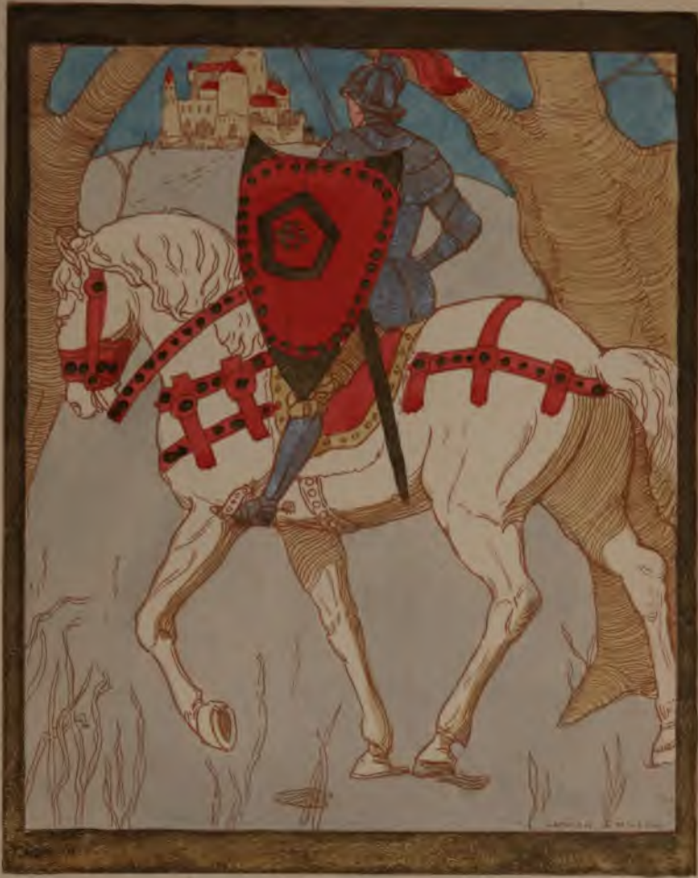
— Sir Gawain —